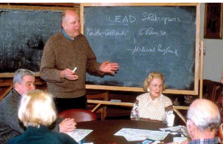
Peer-led and taught, the Institute for Lifelong Learning at Dartmouth has something for everyone.