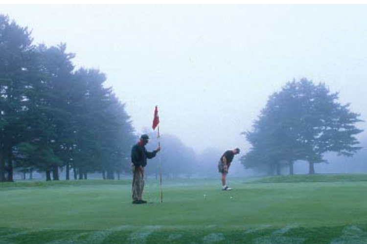
A misty morning on Hanover's public 18-hole golf course.